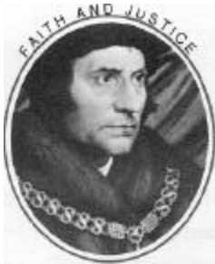
Saint Thomas More 1478-1535