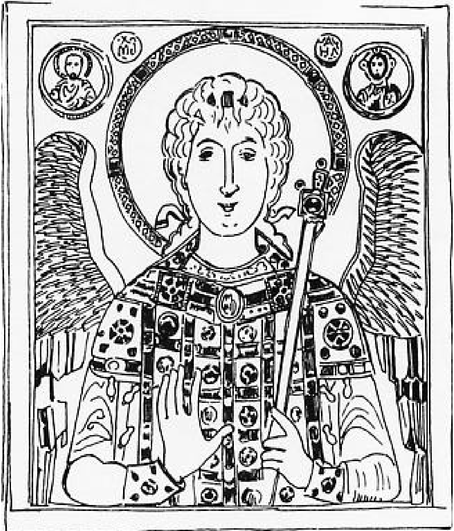
Colour (or color, in the modern USA) Saint Michael the Archangel.