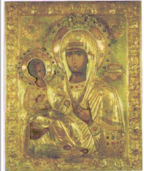
The Trojerucica (pronounced Troyeruchitza) Icon, or, Our Lady with three hands, is the most famous icon in the Serbian Monastery Hilandar, Mt. Athos. There are some 30 wonderful icons in Hilandar.