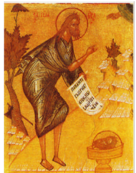
St. John the Baptist (Forerunner) in the Wilderness - Russian