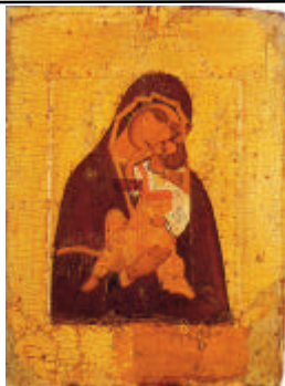
Virgin of Vladimir Our Lady of Tenderness, Virgin Eleusa