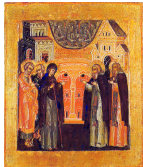
St. Sergius' Vision