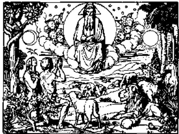
THE CREATION OF THE WORLD

and He blessed that day and made it holy.